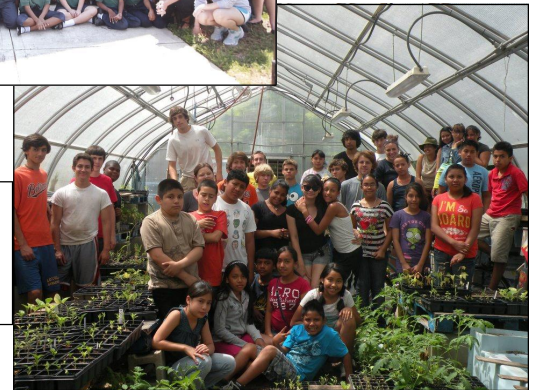
The Center for Environmental Transformation Camden, NJ

Please remember the following persons and intentions in the Mass at the Motherhouse Chapel on Easter Sunday and in all the Masses to be celebrated during the Easter Season.