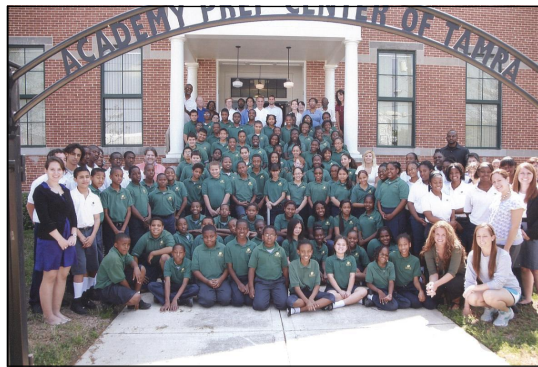
Academy Prep. Tampa, FL

Through your prayers and financial assistance your PRESENCE has been felt in the lives of God's poor for 66 years!!