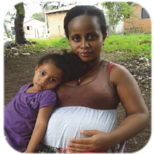
Our Sisters' social center in Araguacema, Brazil provides family support.