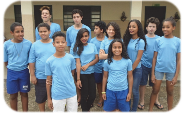
The Children and Adolescents Center (NACRI) received a Mission Society grant to purchase 300 uniforms for the at-risk students who attend.

Easter is a time of rejoicing for Our Risen Lord and the Gospel message He left with us. The Franciscan Sisters of Allegany answered the call to proclaim the Gospel in Brazil in 1946. Today, we have 60 Sisters there in 12 regions where they bring tenderness, compassion and sympathy for people who are suffering. With your generous help, St. Elizabeth Mission Society provides monthly support for seven programs in Brazil as well as grant funding for specific requests. Following are highlights on a few of the programs.