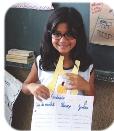
The Mission Society supports St. Francis of Assisi School in Cristalândia, Brazil, which is administered by our Sisters.