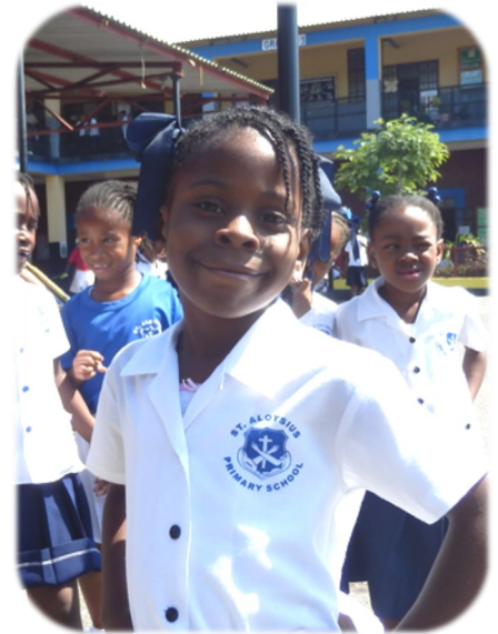
St. Aloysius Primary School in Kingston, Jamaica received a St. Elizabeth Mission Society grant this year to help replace old windows that were a safety hazard.

Do you know what a difference you made in helping fund “outdoor lavatories” in Kingston, Jamaica? Every month, 150 poor and sick