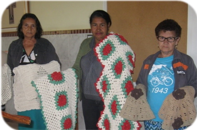
Meeting participants make items they can sell to earn supplemental income, or for some, their only income.

Mission Society funds provided her with a new door (pictured), as well as ongoing support for the monthly meetings.