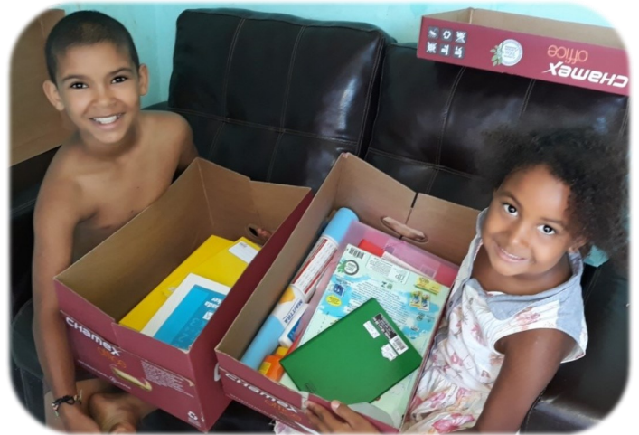
Children receive school supplies.