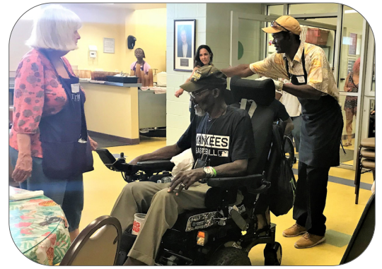
Volunteers greet guests before they enjoy a three-course meal and companionship with other guests and volunteers.