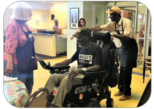
Volunteers greet guests before they enjoy a three-course meal and companionship with other guests and volunteers.