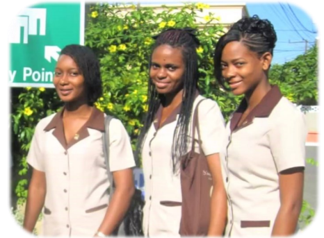
Mission Society monthly support funds tuition, transportation, and/or boarding for students at St. Joseph’s Teachers’ College in Kingston, Jamaica.