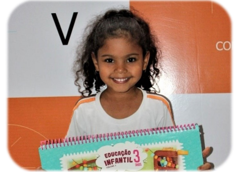
Students at St. Francis Education Center in Palmas, Brazil receive scholarships and books through Mission Society funding.

The Mission Society supports education through ongoing support in Bolivia, Brazil and Jamaica. Being hungry can be distracting to a student trying to learn. The Mission Society sends $750/month to Jamaica to support lunch programs at three elementary schools. Part of the $1,800/month that is sent to Brazil helps with school supplies, books and tuition in Anápolis, Araguacema, Palmas and Cristalândia. St. Joseph’s Teacher’s College in Kingston, Jamaica receives $750/month for tuition, transportation to school and/or boarding plus lunch. The investment in these students is carried forward as they