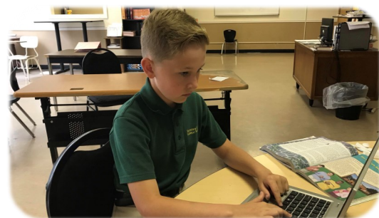
A Mission Society grant purchased 25 laptops for Archbishop Walsh Academy in Olean, NY, helping to improve students' test scores.