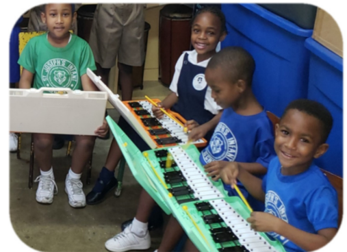
Improved Music Program - St. Joseph's Infant School (Kingston, Jamaica) The purchase of 36 instruments will be the first step toward the dream of a school band.