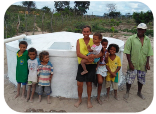
Water to Live - Sacred Family Community Center (Macajuba, BA, Brazil) Franciscan Sisters and volunteers work to promote water-care training events and build cisterns for 15 families who are poor.

Thank you for your generosity that has helped us to accomplish God's work in serving those who are poor in Jamaica, Brazil, Bolivia and the United States. I ask you to prayerfully consider a gift that will bring hope, joy and comfort to those without food, water, and some of life's simplest pleasures, such as art, music and reading.