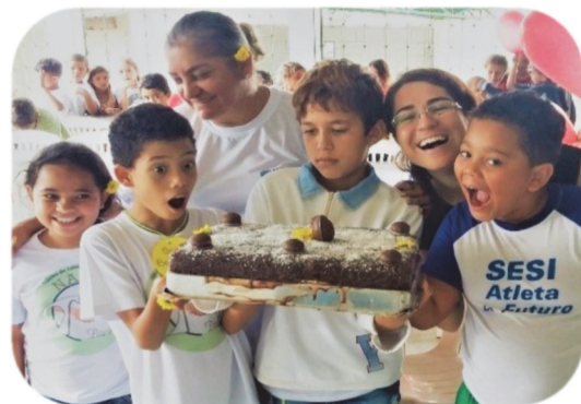
Celebrating Life - NACRI Community Center (Anápolis, GO, Brazil) Mission Society monthly support provides snacks for special celebrations, like this monthly party for the children celebrating their birthdays.