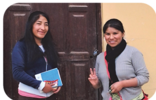
College Scholarships (La Paz, Bolivia) A Mission Society grant helps young women attend college with assistance for tuition, books and transportation. The Sisters believe this helps young people rise from poverty.