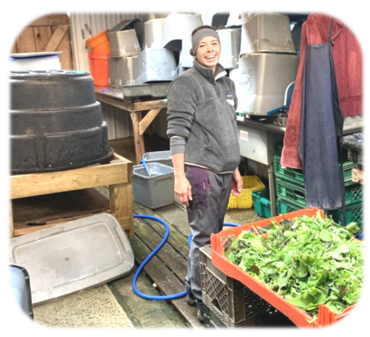
Vegetable Wash Station – Canticle Farm (Allegany, NY) A Mission Society grant upgraded the farm's wash station, making it easier to donate 8,000 pounds of food to local non-profits every year.