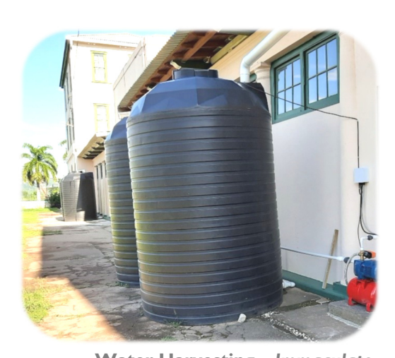
Water Harvesting – Immaculate Conception Convent (Kingston, Jamaica) The Mission Society funded water tanks for rain water collection to reduce dependence on the unreliable & expensive municipal water supply.