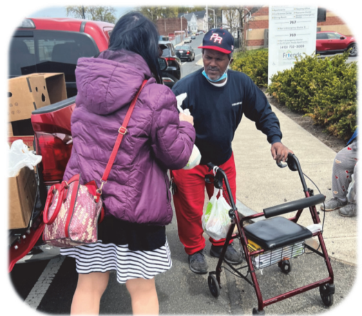
A Mission Society grant helped Holy Cross Church in Springfield, Mass. provide 20,000 sandwiches for its “Sandwiches for the Homeless” program. Each Sunday, 200 individuals come to the church for help.