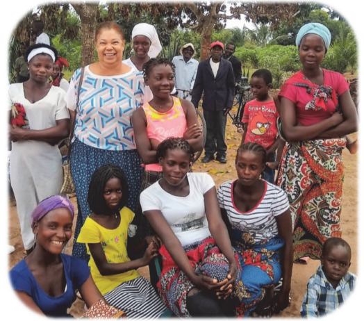
Three Sisters from Brazil are now in Maganja da Costa, Mozambique, Africa, ministering to the needs of the people, who are experiencing conditions of great poverty. The Mission Society will begin sending monthly support.