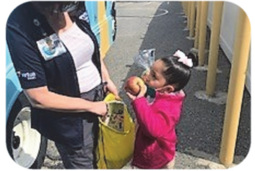
Good Food to Grow – Virtua Health Foundation (Marlton, NJ) Healthy eating habits are encouraged for 300 vulnerable children in 4 day care centers through fresh produce and nutrition education.