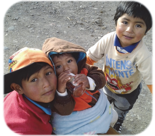
The Mission Society provides $800/month to help Sisters in Bolivia bring much needed assistance to those who are experiencing poverty with food, milk powder, clothes, shoes and education.